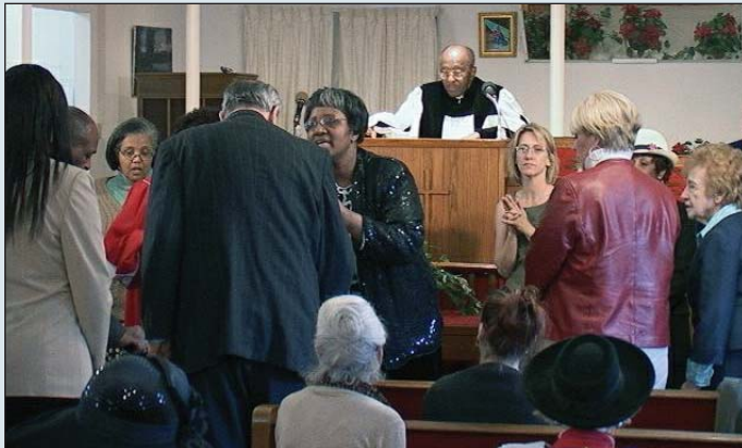
Making a joyful noise unto the Lord.