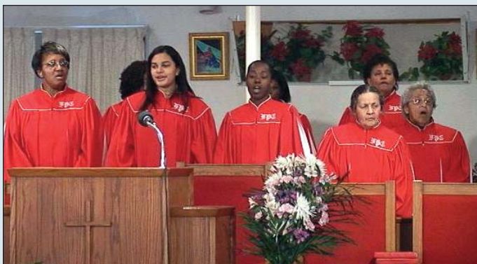
The Choir at the Anniversary Service in Mashpee, Massachusetts.